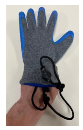
Loops to help don gloves