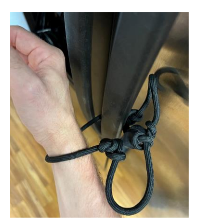
Basic Pattern handle loop