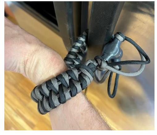
Paracord bracelet handle loop